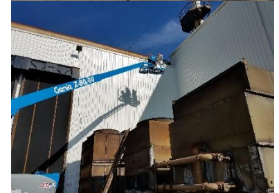
Before and After Restoration of Honda Foundry Facility using NCI